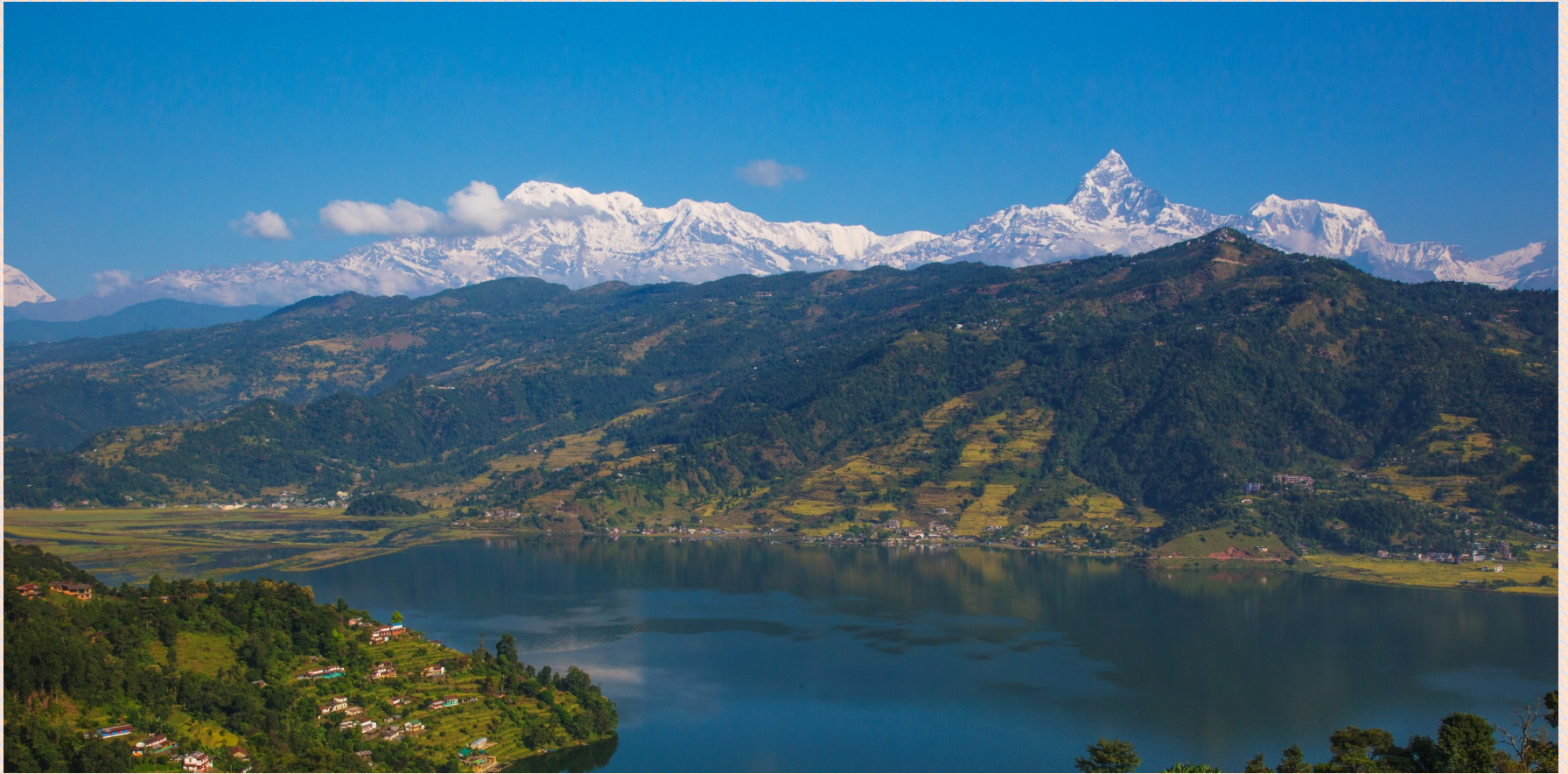
Pokhara, Nepal - Annapurna Himalayan Hill Range (250Km)