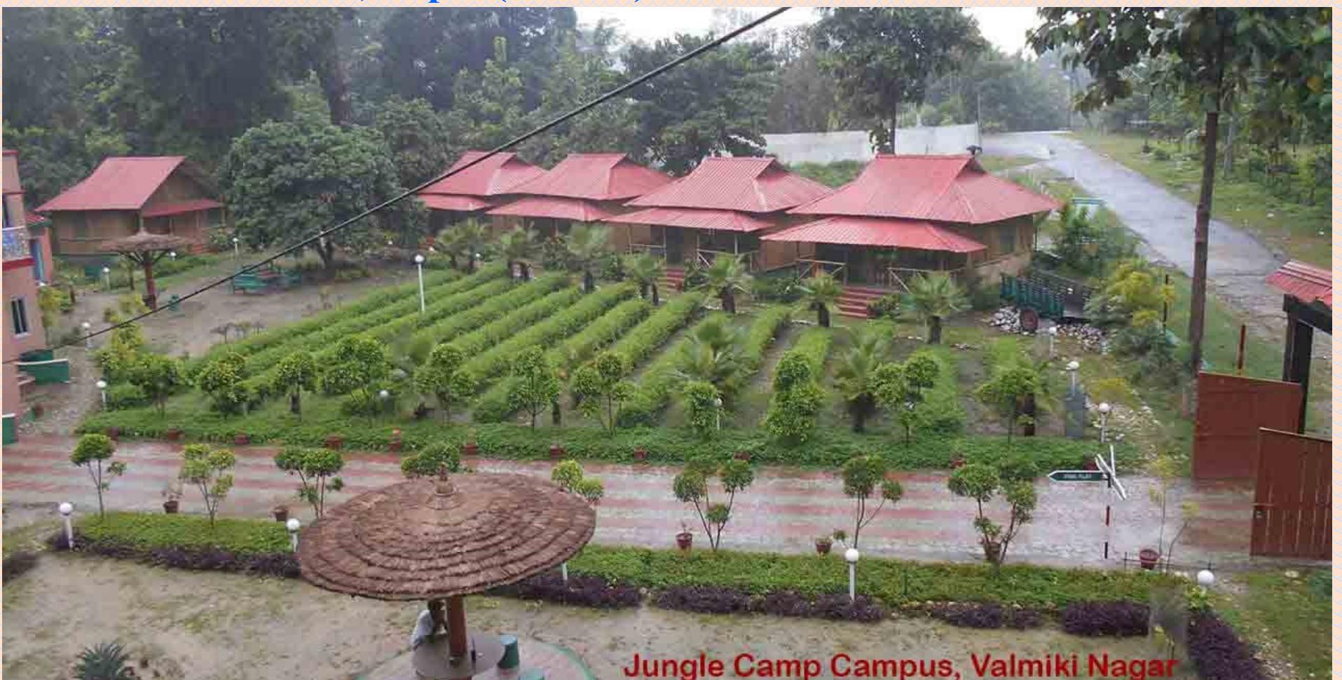
Jungle Camp Campus, Valmiki Nagar Valmikinagar Tiger Reserve (120Km) Jungle camp & Tiger safari