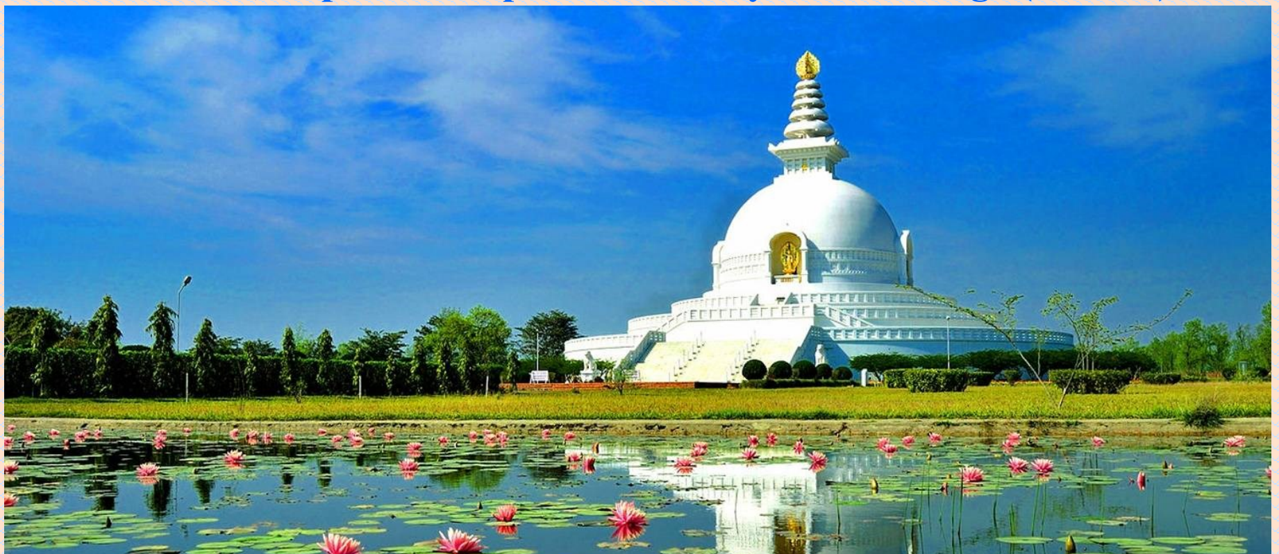
Lumbini, Nepal (100Km) Lord Bhuddha Birth Place