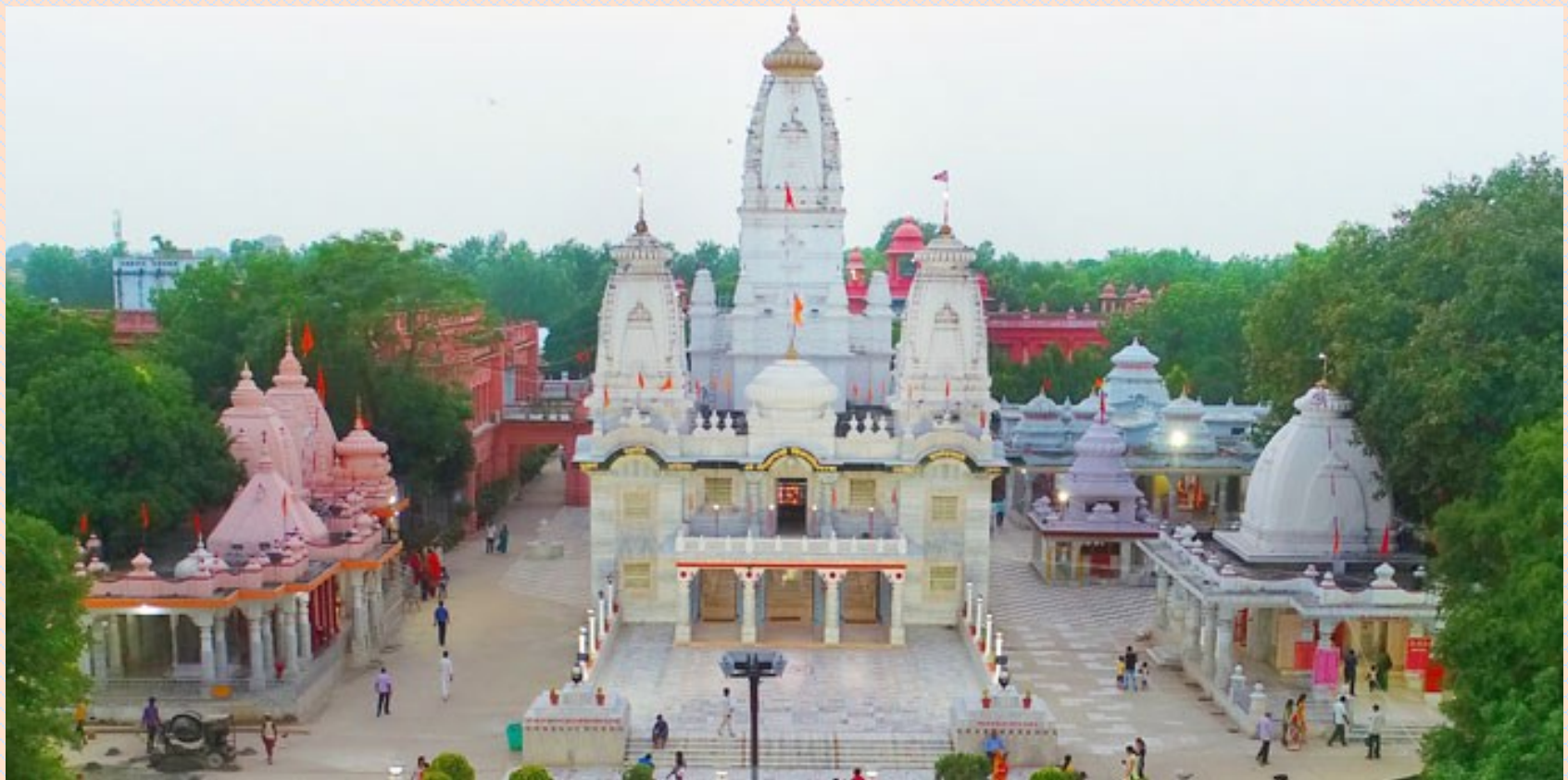
Shri Gorakhnath Mandir, Gorakhpur