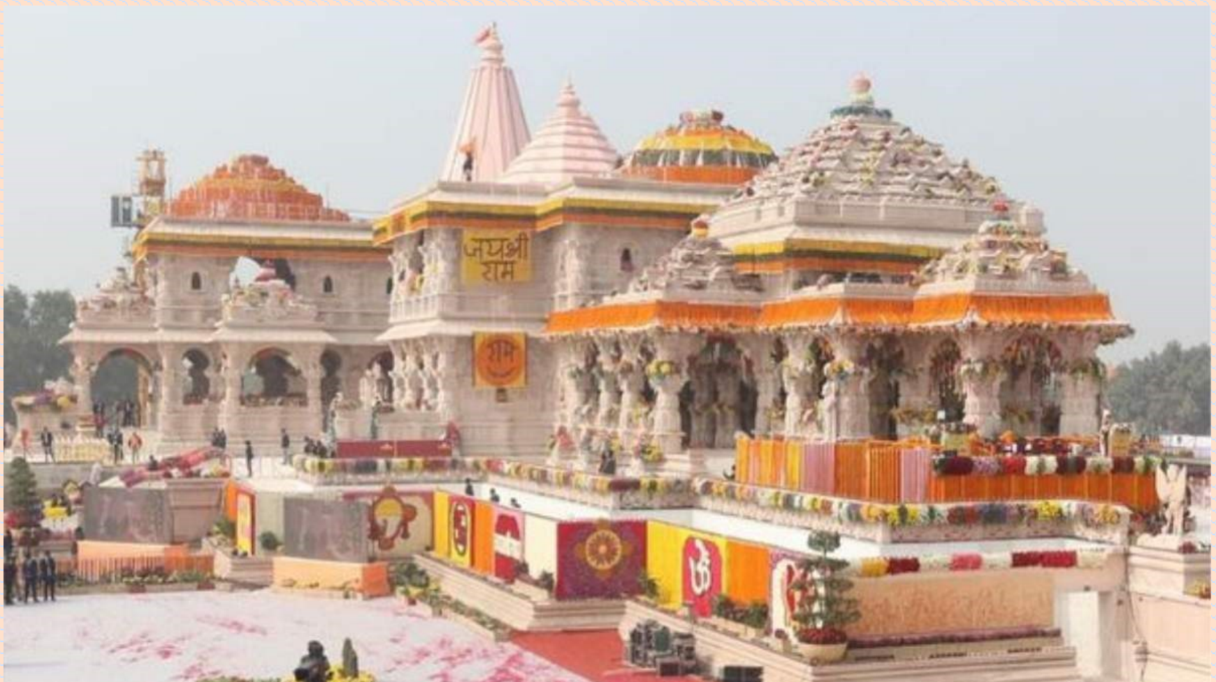
Sri Ram Janmabhumi Mandir, Ayodhya (100Km) (Deepotsav on Diwali)